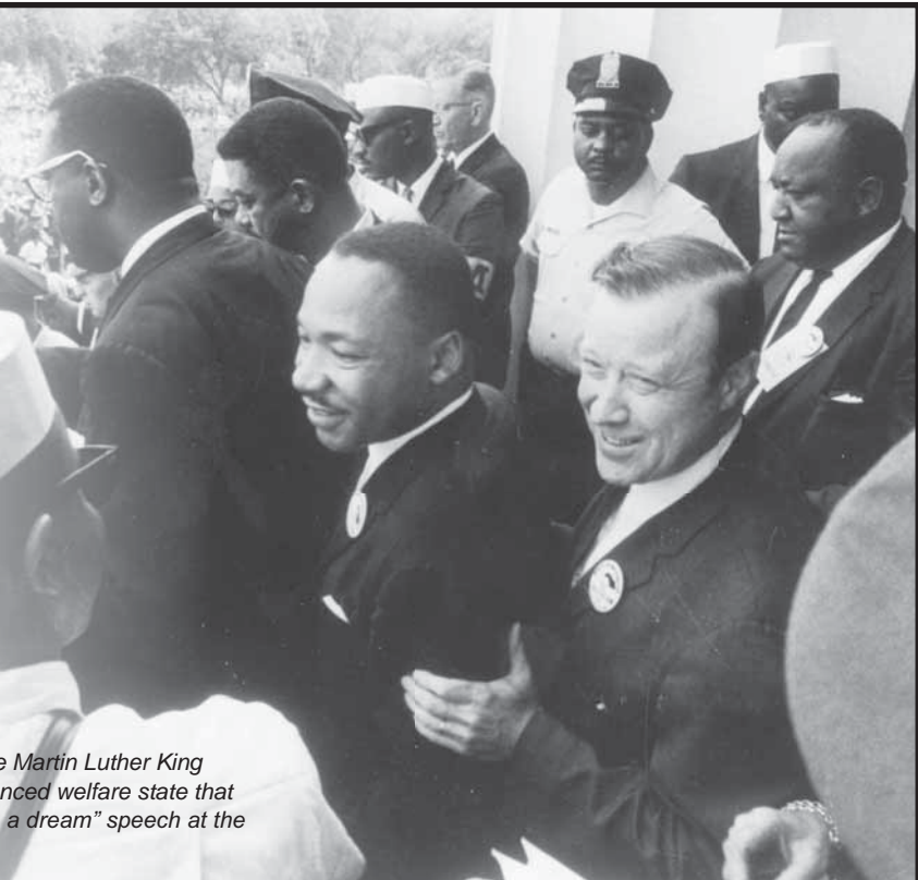
They were brothers for social justice. Walter Reuther stood beside Martin Luther King Jr. as they fought tirelessly for civil rights protections and an enhanced welfare state that would benefit all Americans when he delivered his famous "I have a dream" speech at the 1963 March on Washington.

These men, Martin Luther King Jr. and Walter Reuther gave their lives that the message of equality for all men would be heard. God gave his son that through him man might have life eternal. John 3:16, "For God so loved the world that he gave his only son that whoever believes in him shall not perish, but have eternal life." Even unto this day, men and women are giving their lives for the lost and downtrodden people of this world. In a sermon preached at Ebenezer Baptist Church Dr. King stated, "If I can help somebody as I pass along, if I can cheer somebody with a word or song, if I can show somebody he's traveling wrong, then my living will not be in vain." Walter Reuther said, "There is no better calling than to help ones fellow man." In this new year, I pray the fire of helping others burns deep in your heart.