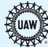
Priscilla Pope Dept. 6300 Corp. Date 10-06-88